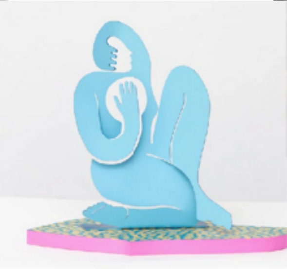
Rose Jaffe - contemporary USA