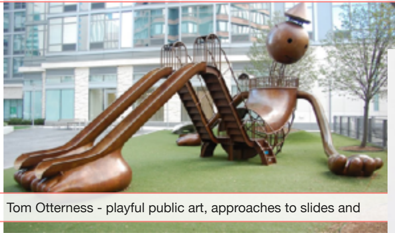
Tom Otterness - playful public art, approaches to slides and