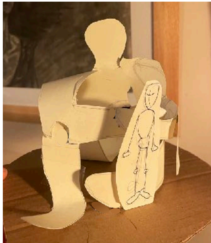
Early proposal maquette with example adult apx 1m80 high - a “planar” form - wrapped and curved, timber on steel frame. Audience will be able to lie in the mother’s Arms and climb on and up surfaces