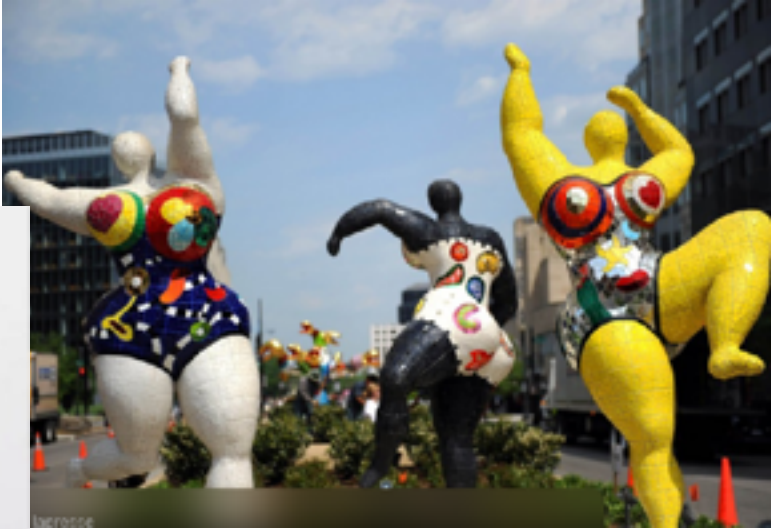
Niki De Sainte Phalle - themes of woman and Mother