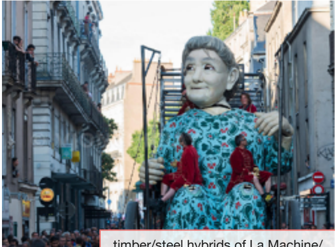
timber/steel hybrids of La Machine/